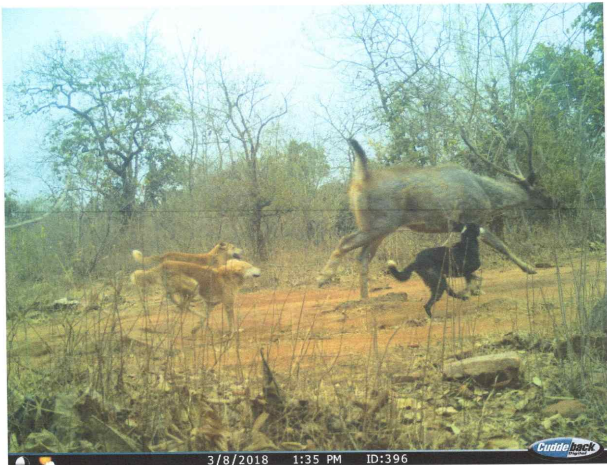
Camera trap images of stray dogs chasing sambar inside tiger reserve