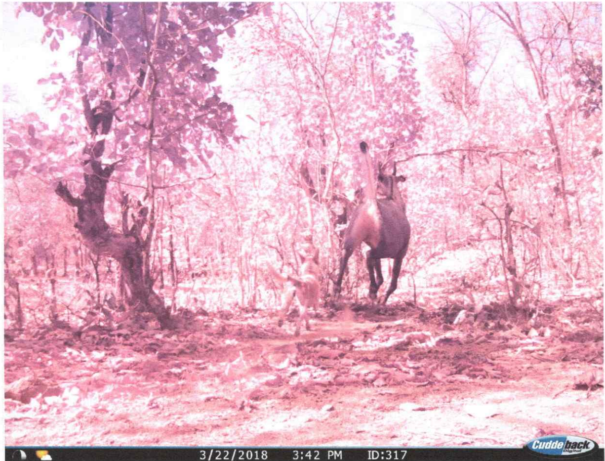
Camera trap images of stray dogs chasing sambar inside tiger reserve