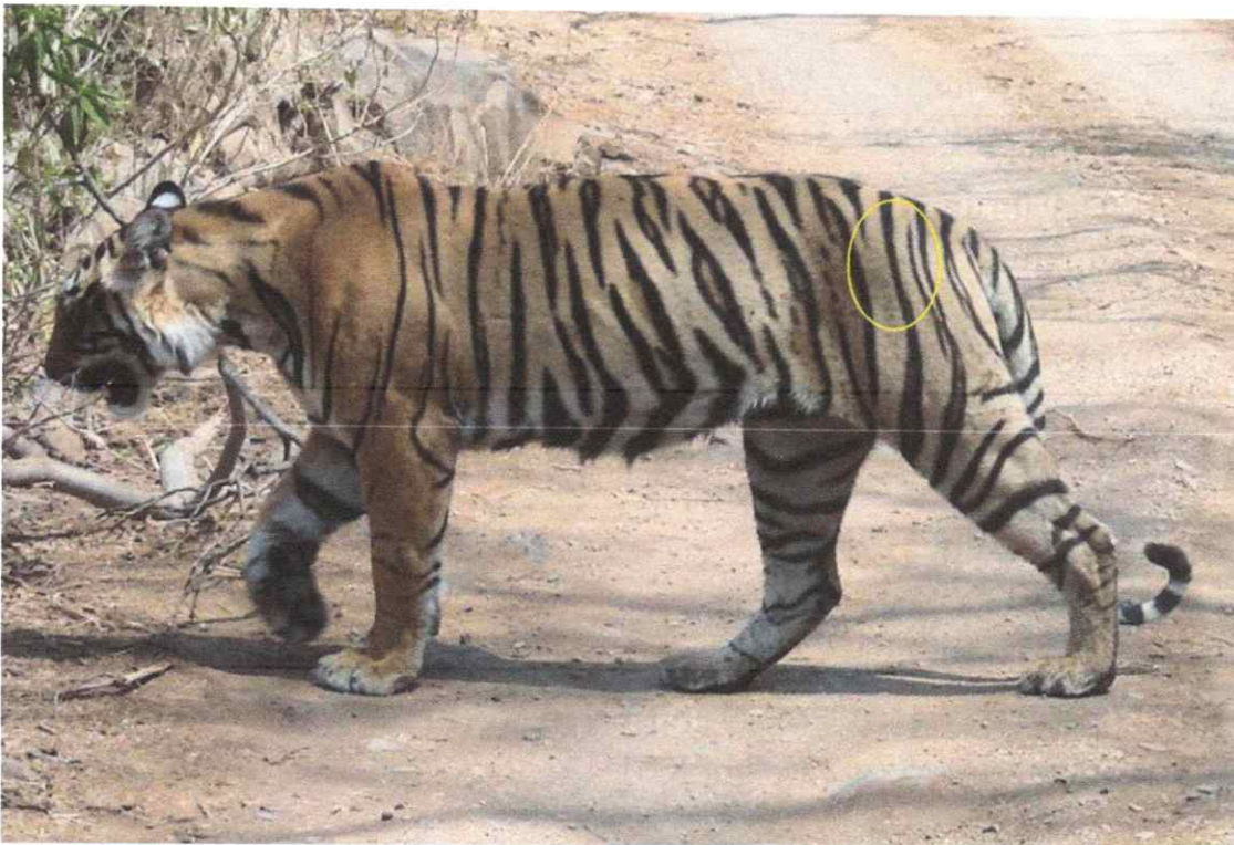
Preferred darting site in a large carnivore

A four wheel field vehicle or trained captive elephants may be used to approach the animal taking due care of human safety and an overriding degree of patience. In a terrain where the vehicle cannot be used, possibility of darting the animal from a machan (raised platforms) may also be considered. Tigers in conflict provide limited opportunities for darting and therefore require adequate experience by personnel in effective darting as well as knowledge of anatomical peculiarities. Hindquarters should be preferred for tele-injection however depending on the opportunities; other suitable areas can also be explored.