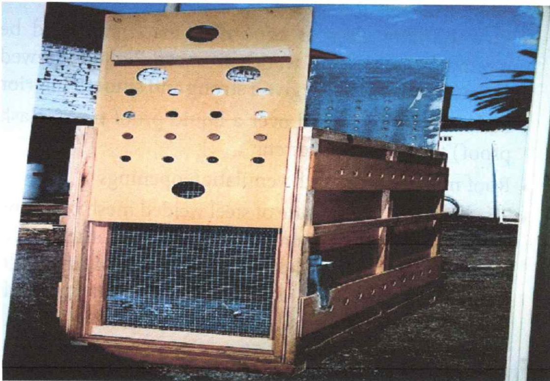
A Cage on the Said Scheme